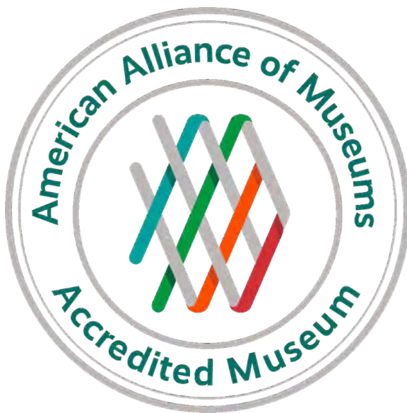
American Alliance of Museums