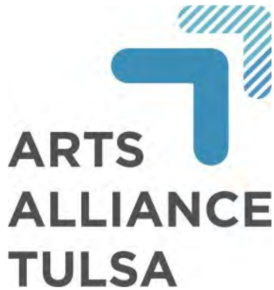
Arts Alliance Tulsa