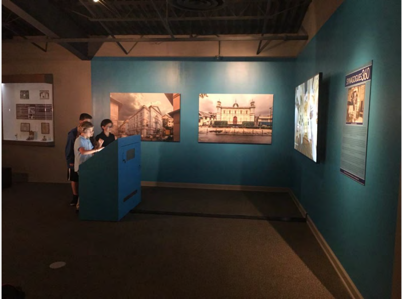
Pictured above: Mizel Jewish Community Day School Students

All may also be viewed in 360° virtual reality at www.Synagogues.org .