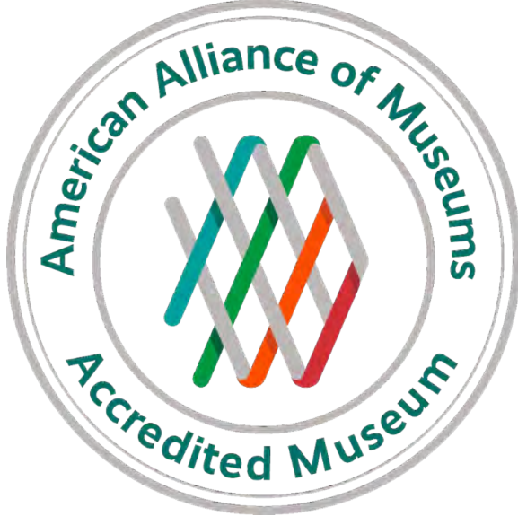
American Alliance of Museums