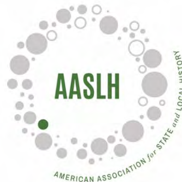
American Association of State and Local History