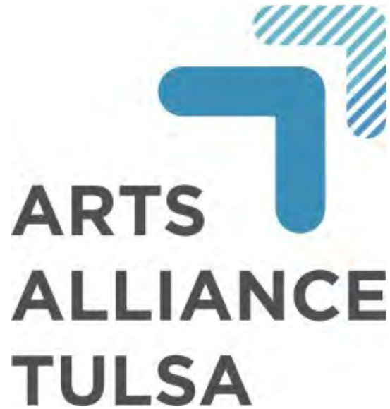
Arts Alliance Tulsa